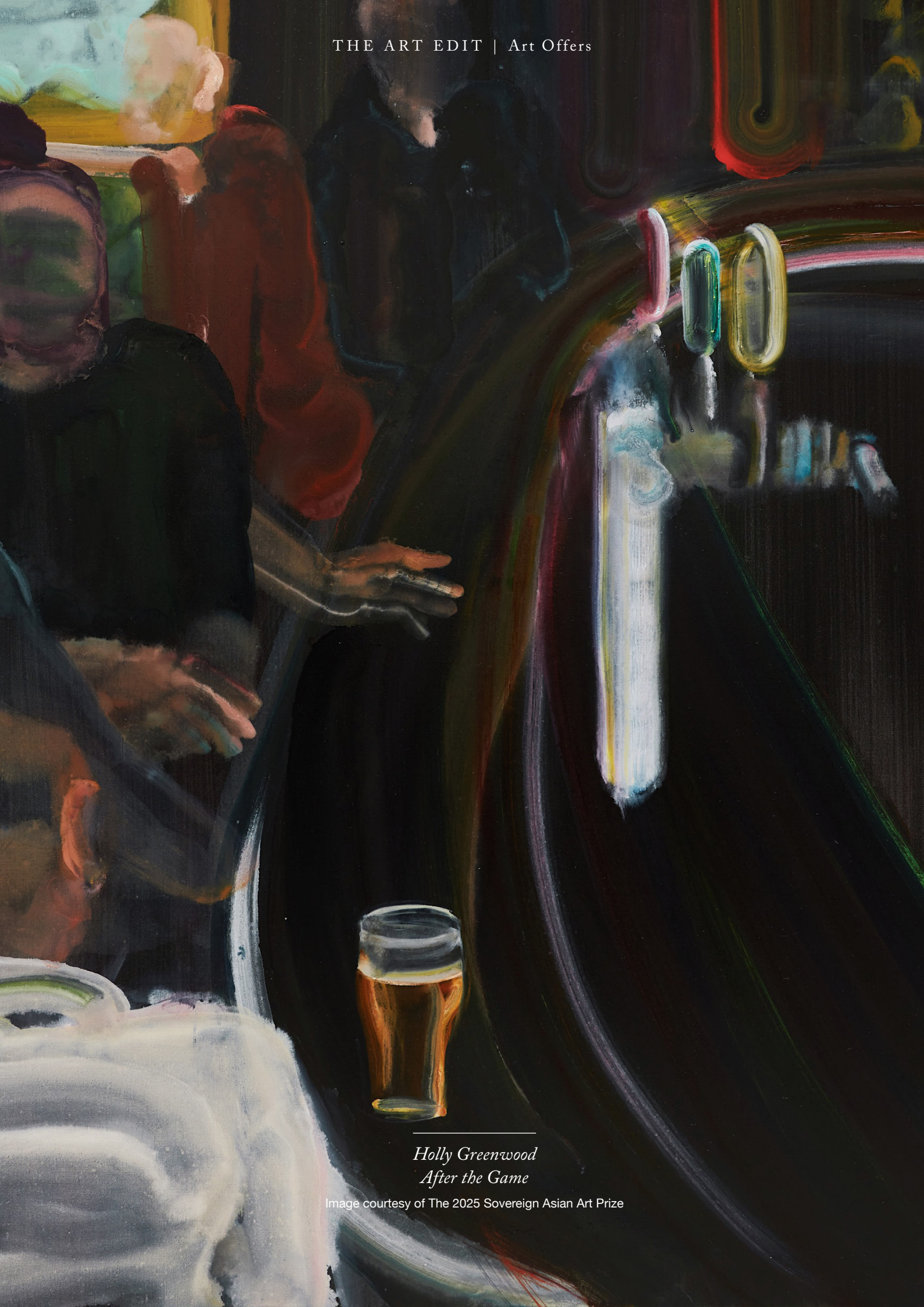
Holly Greenwood After the Game