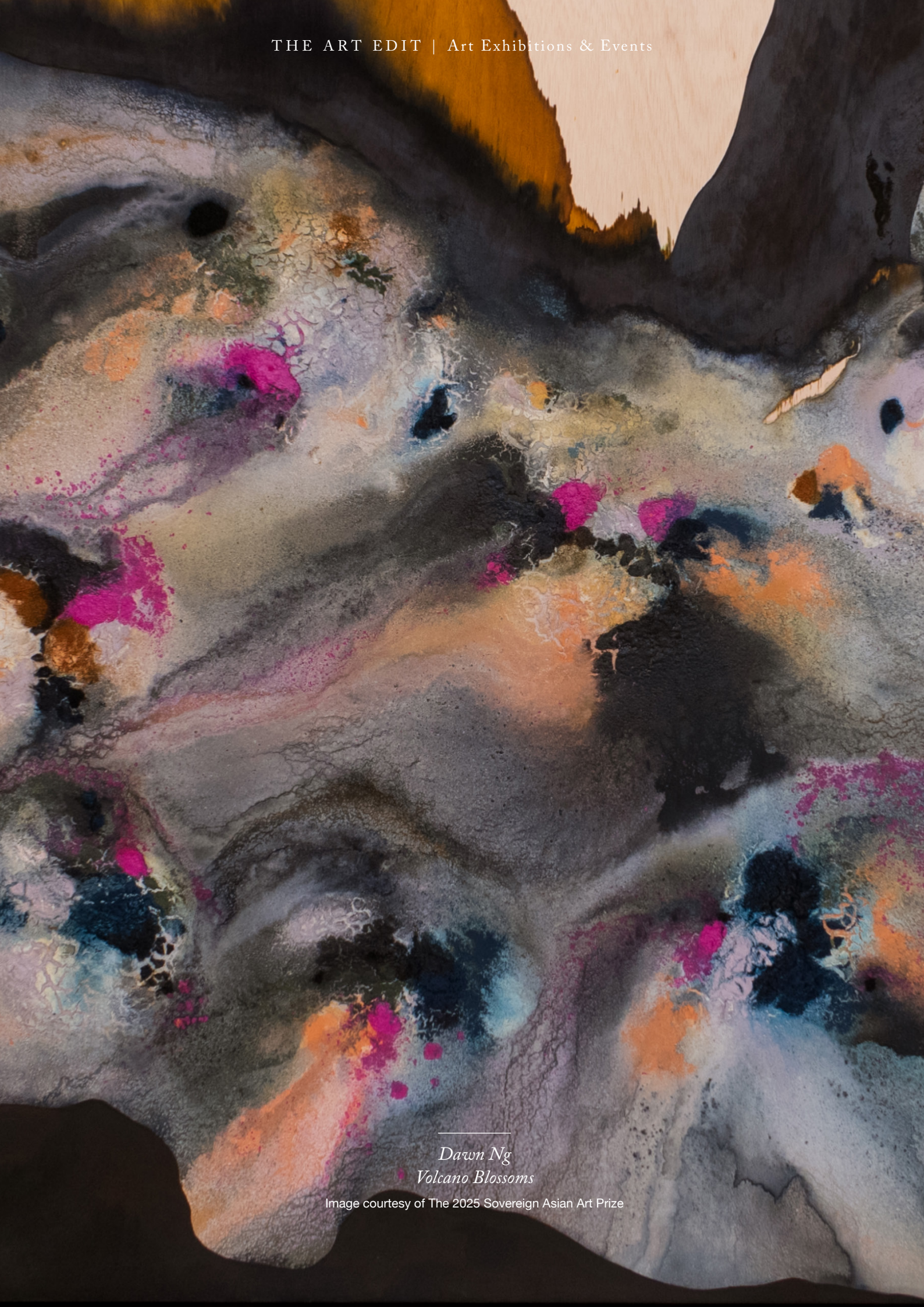
Dawn Ng Volcano Blossoms